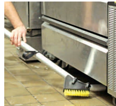
Vacuum under fixtures, shelves and seating with the versatile vac wand.