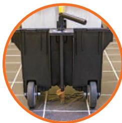
Variable Flow Spigot Dispenses Fresh Solution

Kitchen Cleaning and Degreasing Restroom Floors Grouted Floors Entrance Ways Spill Pick-up Flood Pick-up Floor Stripping