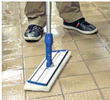
Rapidly spread solution across floor with the Ergo Speed Spreader.