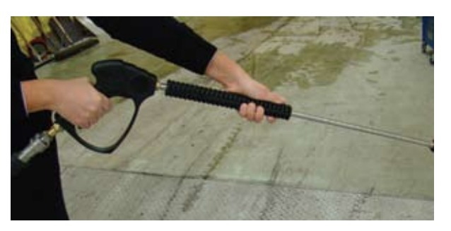
Enhance cleaning flexibility Blast clean hard-to-reach areas easily with the 7.6m, 2200 psi pressure washer.