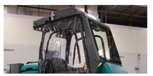
Protect operator and machine Ensure safety in severe environments with heated and cooled soft cab.