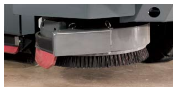
Widen cleaning path from 1220 up to 1630 mm Achieve superior edge-cleaning capabilities and maximum productivity with the side brush.

by continually filtering and recycling recovered solution with the ES® system.